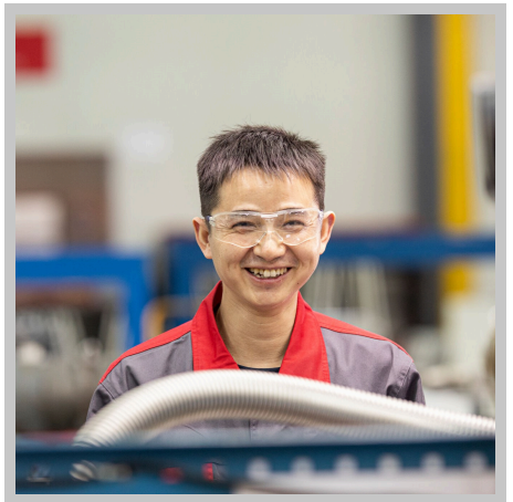
Errors and/or changes excepted. - 9/30/2025

Are you looking for an optimum vacuum solution?